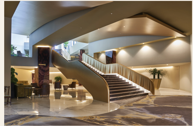
Legends: Above: Savoy Palace Hotel. Below: The Lodge Hotel

Atelier Nini Andrade Silva's dedication to timeless design and its commitment to cultural storytelling make it a trusted partner for luxury hotel brands and iconic properties around the world.